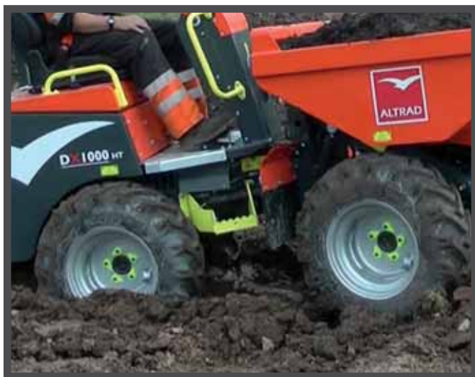
HIGH-QUALITY, ALL-TERRAIN TYRES WITH VALVE PROTECT GUARD & WHEEL NUT INDICATORS