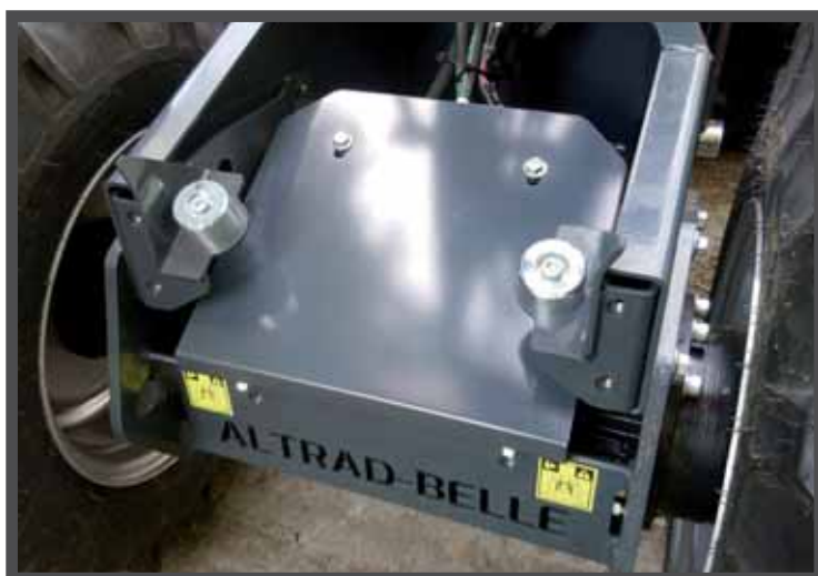
ROBUST STEEL, FRONT MATERIAL INGRESS GUARD PREVENTS DAMAGE TO HYDRAULIC CIRCUIT