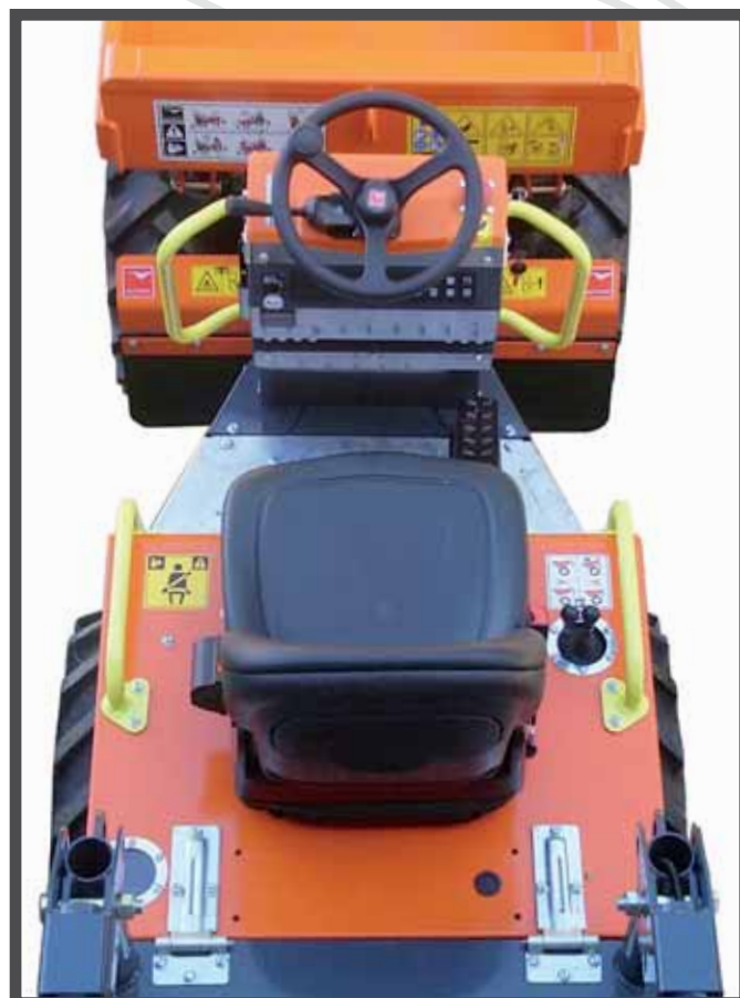
ERGONOMIC OPERATOR STATION WITH EASY-TO-REACH CONTROLS, LEADING BRAND COMFORT SEAT AND GOOD ALL-ROUND VISIBILITY