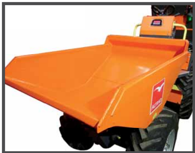
ROBUST, EASY-CLEAN 1000KG CAPACITY SKIP FULLY RETURNED EDGES TO PREVENT DIRT INGRESS