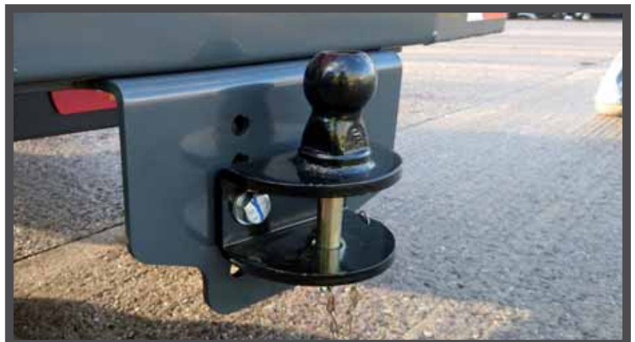
TOW HITCH OPTION