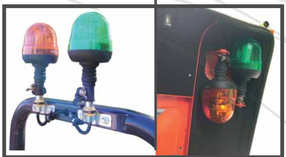
LOCKABLE UNDER-CANOPY BEACON STORAGE