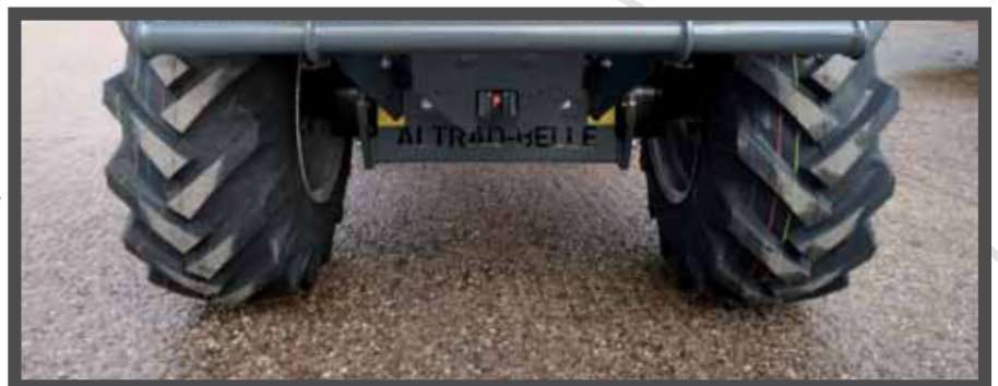
WHEEL SPACER OPTION ADDS 100MM TO THE TRACK WIDTH GIVING ADDED SAFETY & STABILITY