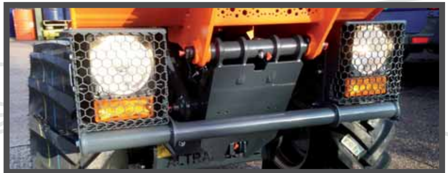
HEAD LIGHTS & INDICATORS FROM UK ROAD KIT OPTION