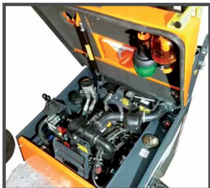
GOOD ACCESS TO KEY FEATURES WITH SELF-LOCKING GAS STRUT AND PROVEN YANMAR 3TNV76 DIESEL ENGINE