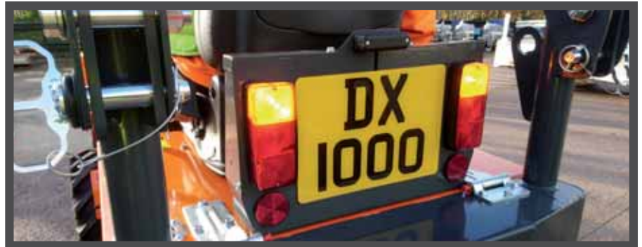
BRAKE LIGHTS, INDICATORS & NUMBER PLATE MOUNT FROM UK ROAD KIT OPTION