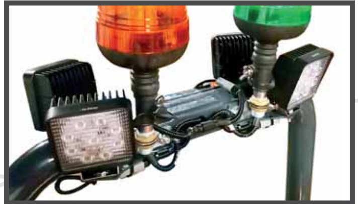
2X & 4X WORK LIGHT OPTIONS AVAILABLE